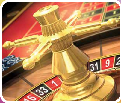
Foxwood Resort Casino

Visit Foxwood Resort Casino , where action, fun and excitement come in groups. With five casinos featuring over 6,300 slots and 380 tables, over 1,400 luxurious rooms and deluxe suites, 24 restaurants, 17 specialty shops, headline entertainment throughout the year, and a nearby golf course, its easy to see why having fun is not hard to do. This is one of the largest casinos in the world and is only 100 miles from New York City.