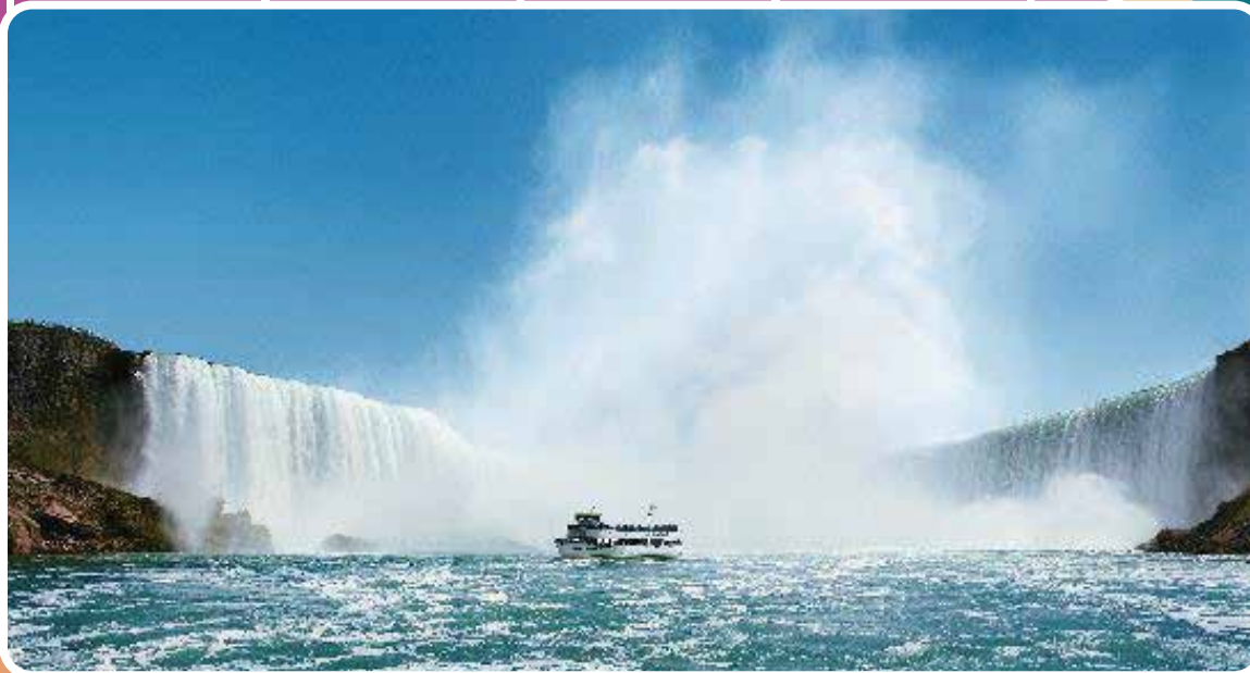
Horseshoe Falls & Maid of the Mist

Overlooking the breathtaking view of the Falls, the Revolving Dining Room is the height of dining excellence. The dining room, located in the Skylon Tower , revolves one rotation hourly. Award-winning continental cuisine is presented in an elegant setting 775 feet above the Falls. Your meal is included! We always have a wonderful dining experience at the Revolving Dining Room.