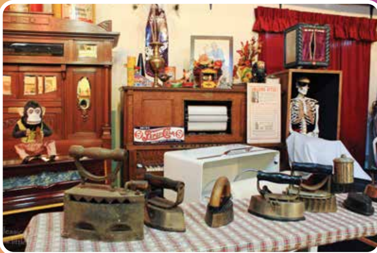
Dr. Ted's Musical Marvels Museum

The Indianapolis Motor Speedway Hall of Fame Museum is on the grounds of the famed Indianapolis Motor Speedway, a National Historic Landmark since 1987. The museum appeals to more than just the racing enthusiast! Displayed, are more than 75 racing cars, including Indianapolis winners as well as race cars from internationally renowned motor sports events world-wide. Also displayed are several examples of early antique and classic passenger cars. Many of these cars were built here in Indianapolis, such as the Stutz, Cole, Marmon, National and Duesenberg. Three of the first four 500 winning cars are permanently on exhibit, including the Marmon "Wasp" which won the first 500-Mile Race in 1911. The Marmon "Wasp" was the first single-seat race car and is believed to be the first automobile to make use of the rear view mirror. A trip around the famous oval in one of the Speedway vehicles is offered to the public whenever the track is not in use for racing, testing, or closed due to weather conditions.