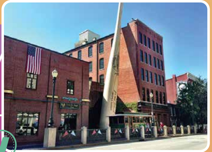
Slugger Bat Factory