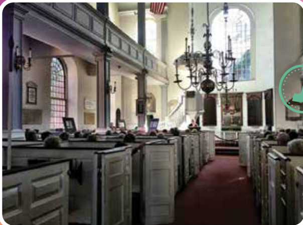
Old North Church

The enduring fame of the Old North Church and its place in the American story derives from a fleeting moment on the night of April 18, 1775. It was then that the sexton (church officer), Robert Newman, climbed the steeple and briefly hung the famous two lanterns, which touched off the War for Independence.