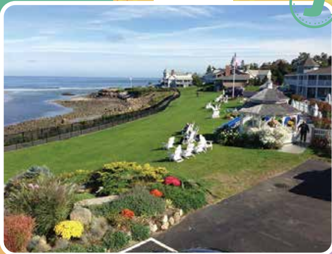
Anchorage By The Sea