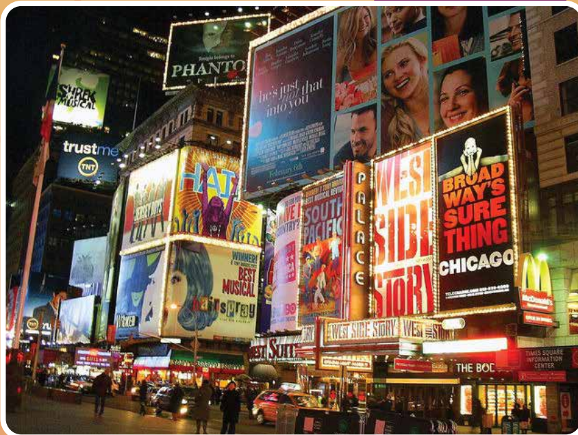
Broadway Theatre District