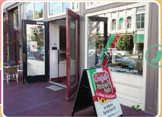
Luigi’s Italian Restaurant