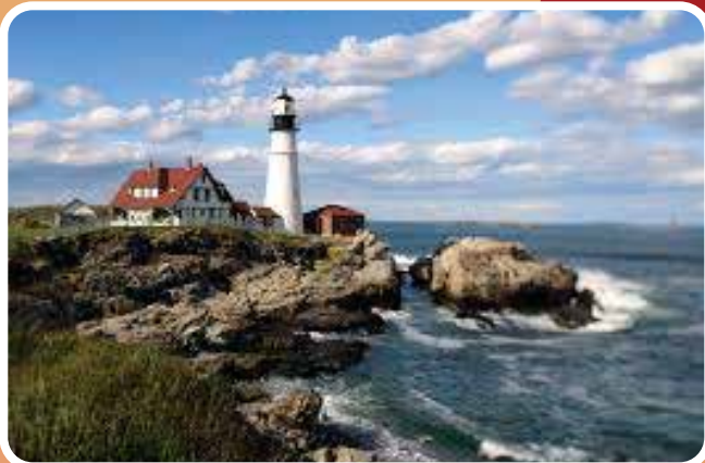
Portland Head Light

You may want to enjoy a leisurely stroll along Ogunquit’s famous famed Marginal Way . Accessible at the edge of the property, Marginal Way follows the rugged coast into picturesque Perkins Cove, Ogunquit’s quaint fishing village that is spanned by a charming footbridge-drawbridge at its mouth. This tiny cove offers splendid scenery, numerous small shops and galleries housed in weathered fishing shacks, sightseeing and a variety of dining establishments. A quaint trolley ride is a fun way to see the sights here in Ogunquit.