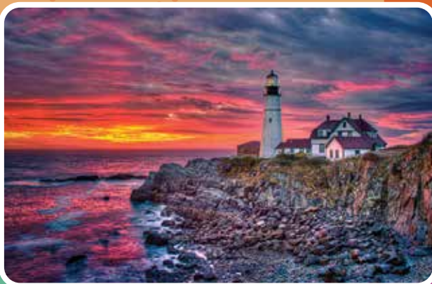
Portland Head Light