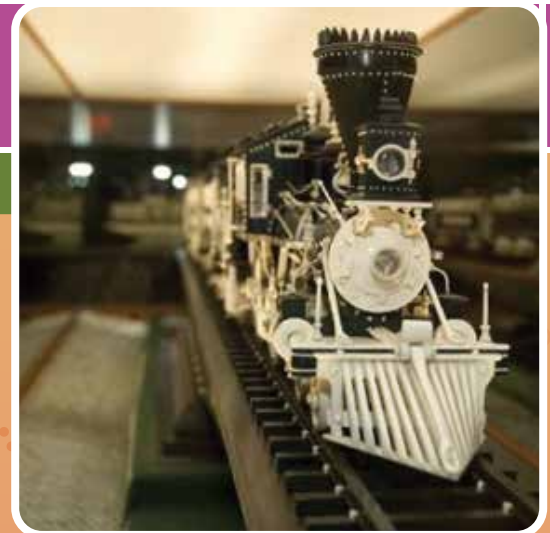
Warther's Carvers Museum